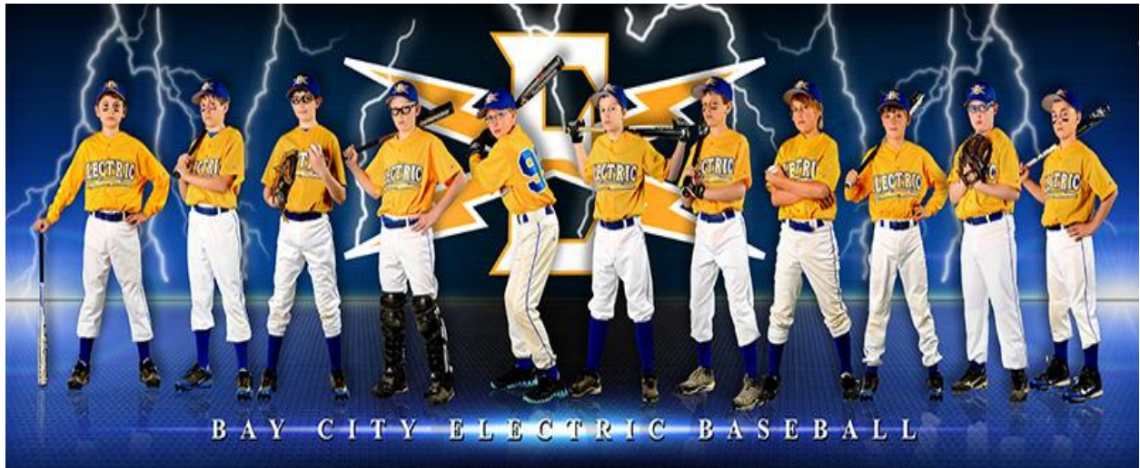
Electric players