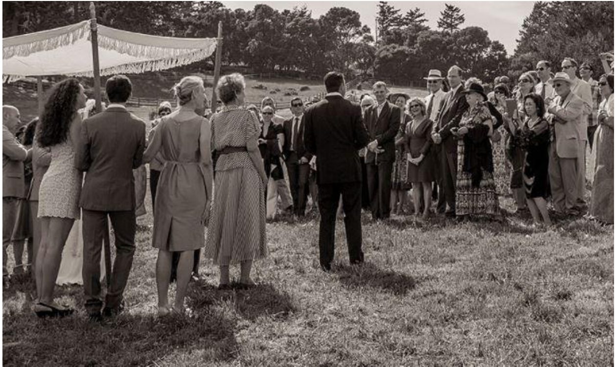
Awaiting the bride

Francis specializes in creating images for commercial and corporate events for use on websites, displays, and marketing. Experienced with photojournalism and corporate photos, Francis brings his skill set to every event to produce professional results.