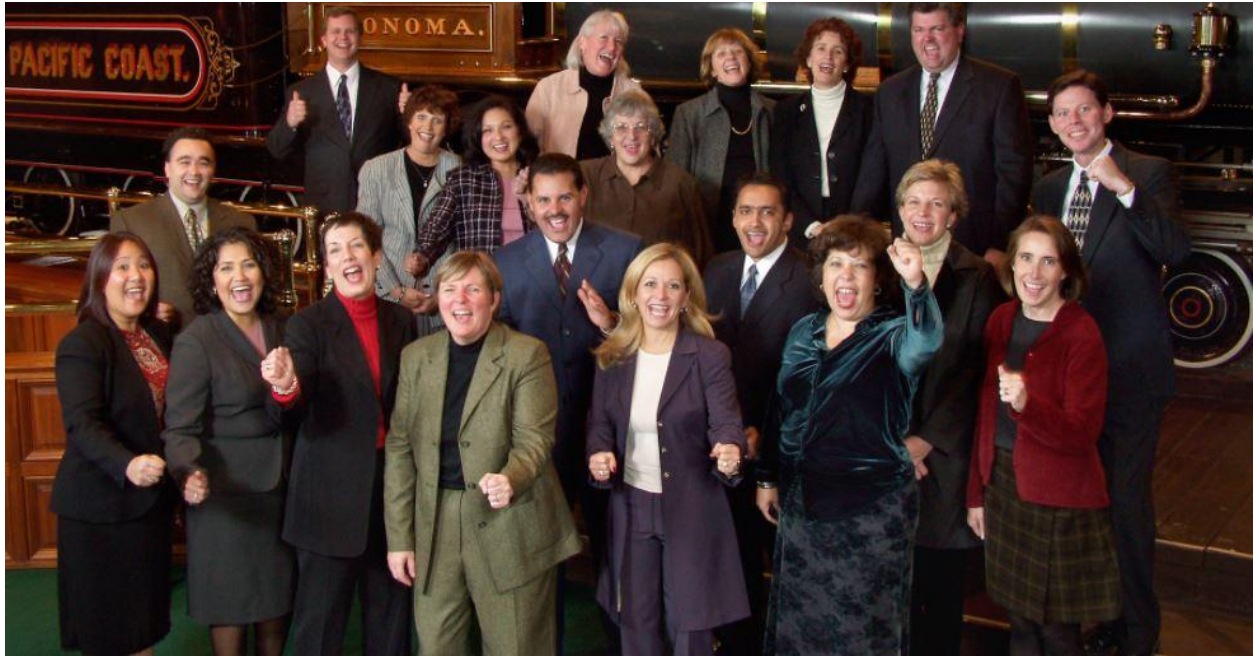
Team celebration