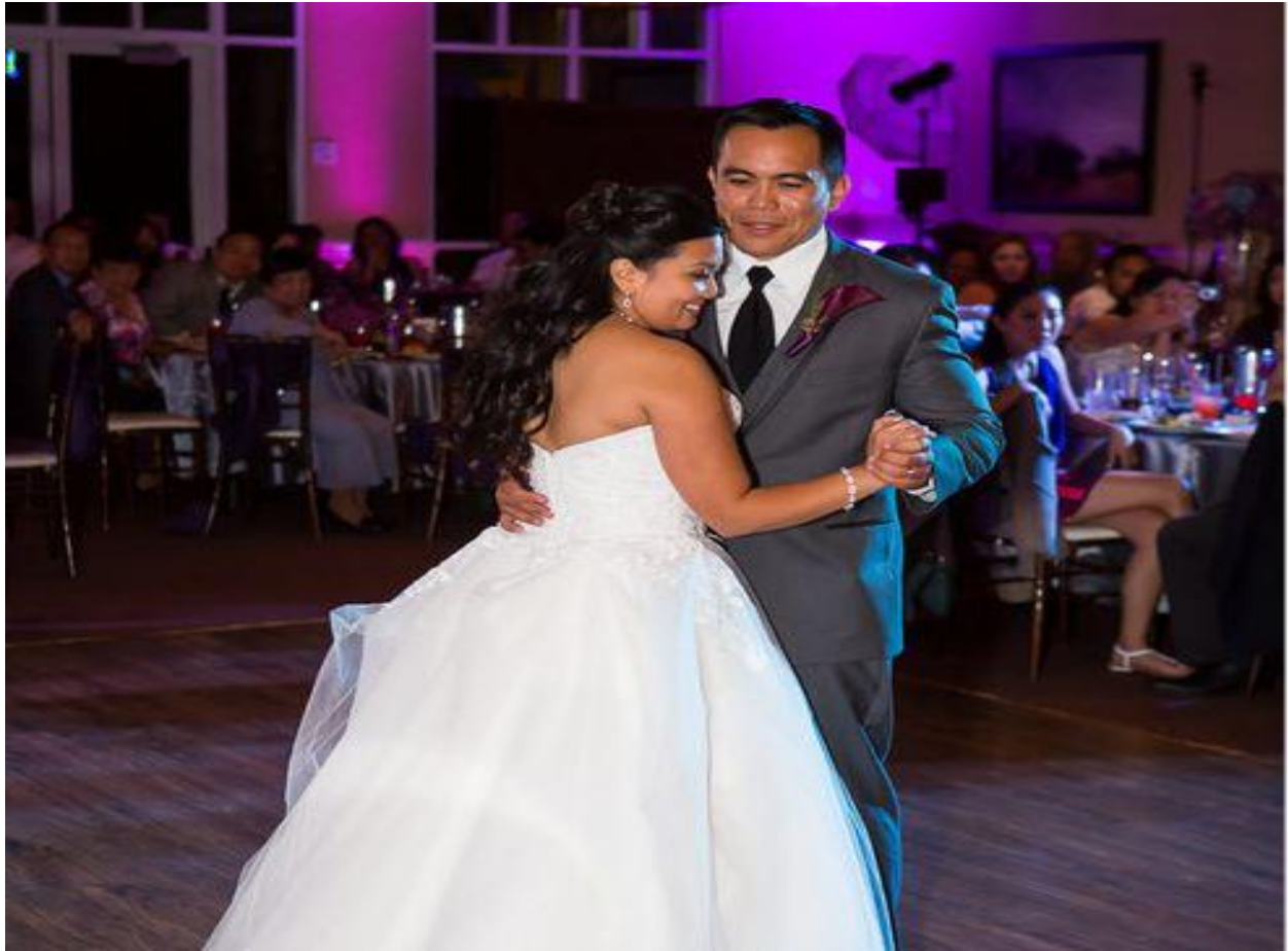
First dance

Lightbox Creative is an innovative company committed to delivering its clients the most thoughtful content. Specializing in event photography as well as live video content, they take your event to the next level.