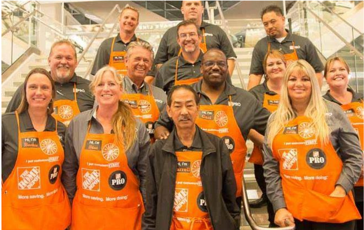
Home Depot Team